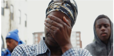
A scene from A Reckoning in Boston.