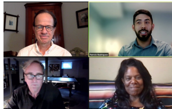
Utah Humanities in partnership with Weber State College and Westmister College. Virtual screening.