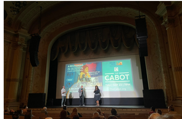
The Cabot Theatre, Beverly, Mass. In-person screening.