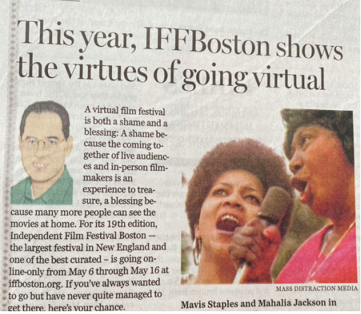
The Boston Globe, Ty Burr.